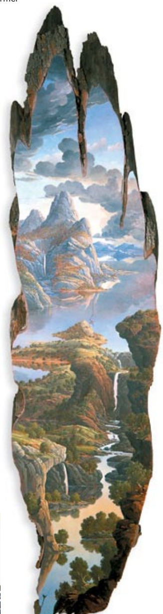
"Tall Sassafras Slice I" is an oil on sassafras log.